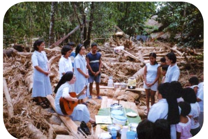
They desired to have their lunch where their houses were and in spite of their tears, they asked us to sing "Our Father"

As we went home this is what remains in us: the pain of the city of the poor who lost everything, the children who are alone and in great suffering and the nature that needs to be taken care.. stories of God's love and comfort for His people and the experience of God's wonder in the life and experiences of each person we have encountered.