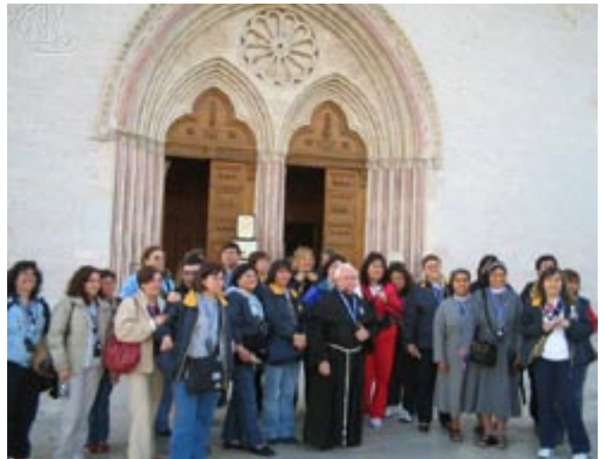
Assisi: Basilica Superiore di S. Francesco