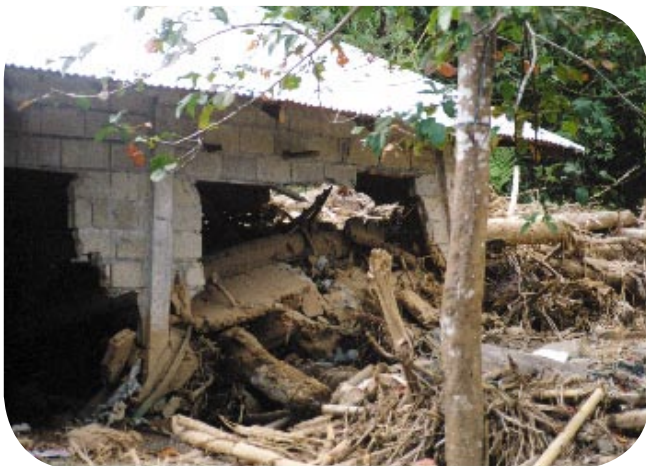
It was the only stone house of the place