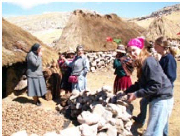
"It will be for 3500 metres of altitude, but I feel God is almost very near..."