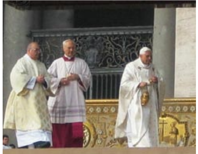
Benedict XVI during the celebration in St. Peter's Square

God manifested them in different ways; it was necessary to thank Him. For this motive the pilgrims conducted a thanksgiving in a small chapel at Monte Berico. The thanked God for all the graces they received, for their families that the Lord had given them, for the unconditional support of the sisters who had received