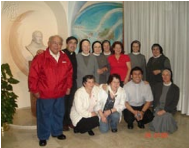
Atrio della Casa generalizia "Assisium" ... foto-ricordo con il Consiglio generale