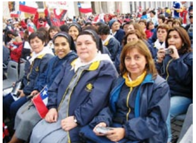
There was an atmosphere of great enthusiasm and of spiritual silence at the same time