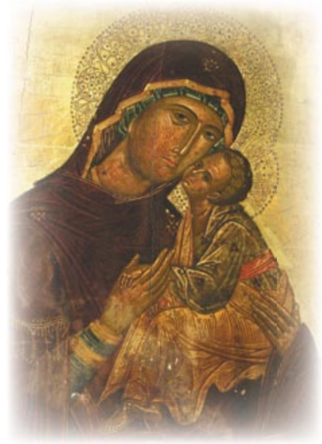
"Mater Admirabilis" Museo - Casa Madre - Gemona