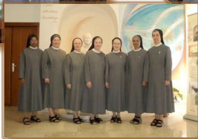
The two general councils