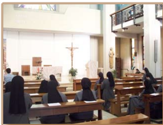
In the Church of the Provincialate House “M. Immacolata”

the sisters enjoyed to meet maybe after many years! The capitular sisters, after the initial welcome, gladden by the song of the young sisters, had the opportunity to visit the school, the infirmary and the community. They gathered afterward in the church for the celebration of the Vespers and then for a abundant supper buffet style, prepared with care by the sisters of the house in a joyful atmosphere and of gratitude for being together!