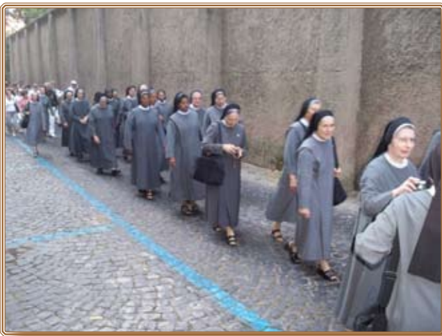
On going to the Papal Palace of Castel Gandolfo