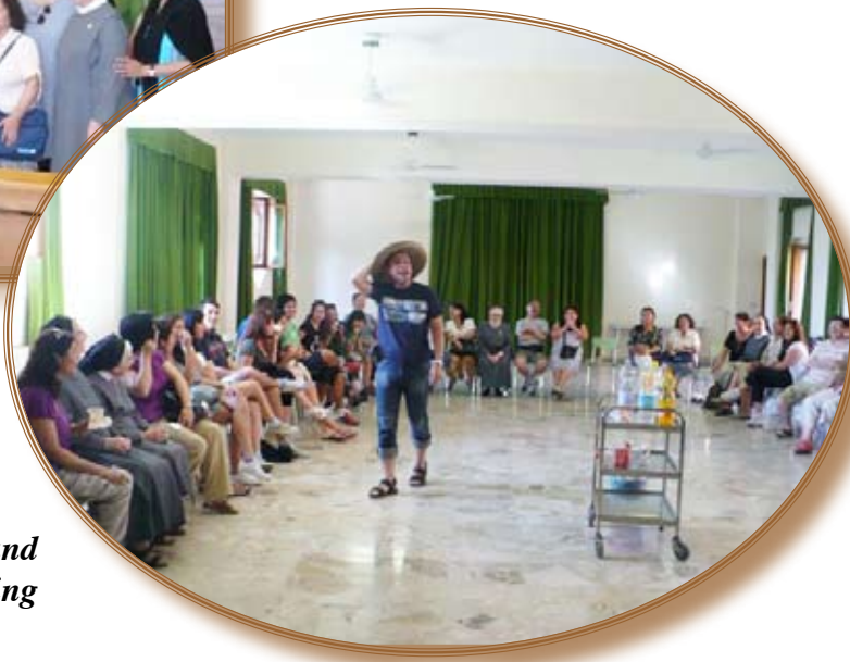
Moment of fraternal sharing and refreshment with songs and thanksgiving