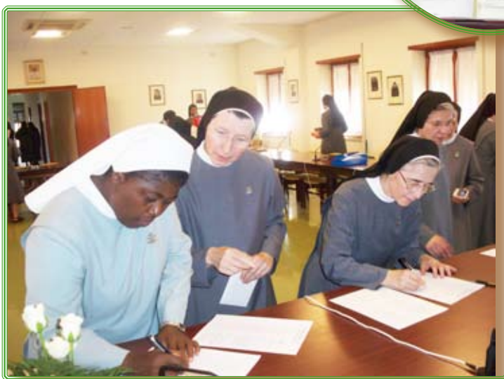
The signatures of the Minutes at the closing of the general Chapter

Tomorrow the capitular sisters will live out another very touching moment participating to the public audience of the Holy father Benedict XVI in Castelgandolfo.