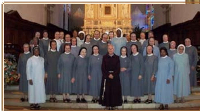
Motta di Livenza (TV)