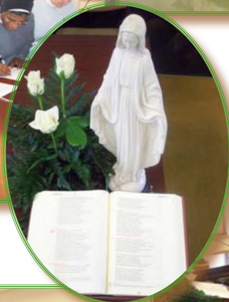
The small statue of the B.V. Mary on the presidential table watched over the Chapter works