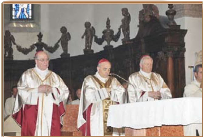
The three Concelebrating Bishops