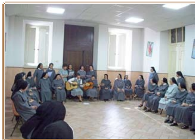
With the Community in the Provincialate House “M. Immacolata”

all the altars of the world! This faith must sustain and nourishes us even in the most difficult moments, when we feel unworthy. It is He who works every good in us and through us!