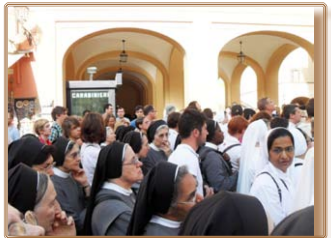
Waiting for the Pope