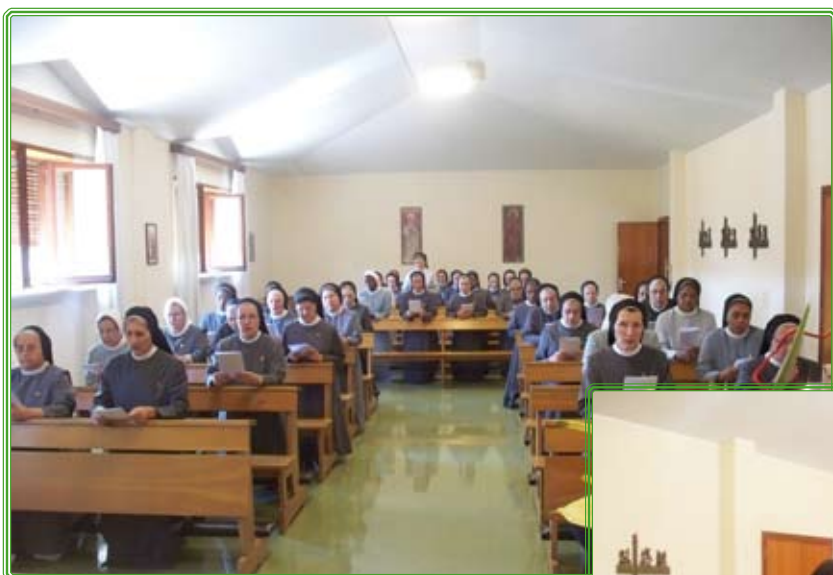
A moment of prayer at the closing of the XIX General Chapter