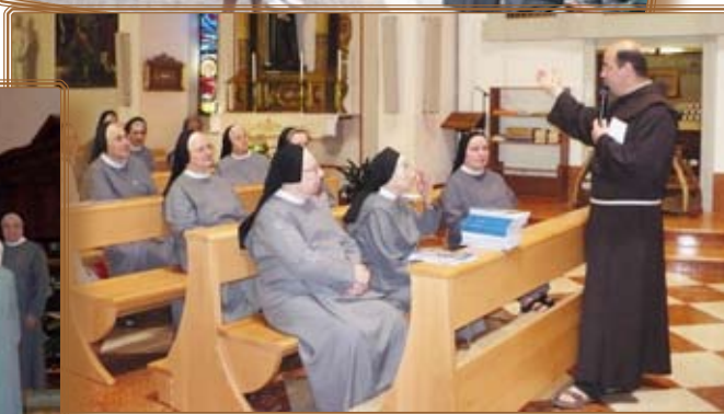
Saint Anthony Shrine Gemona