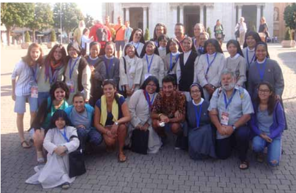
The junior sisters in Centocelle

First of all, we try to take small steps to "build bridges" by living in our community concretely, the richness we have received in these days of meeting, with the awareness that formation does not end with the conclusion of the Convention but only the beginning of a daily task on each one.