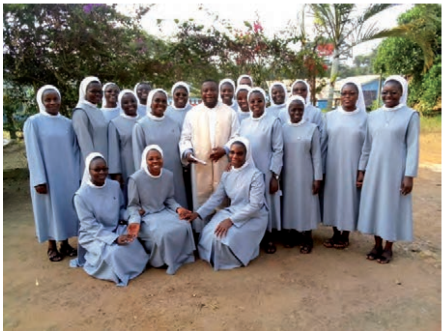
Junior sisters of the Vice-Province “Holy Martyrs of Uganda”-Africa