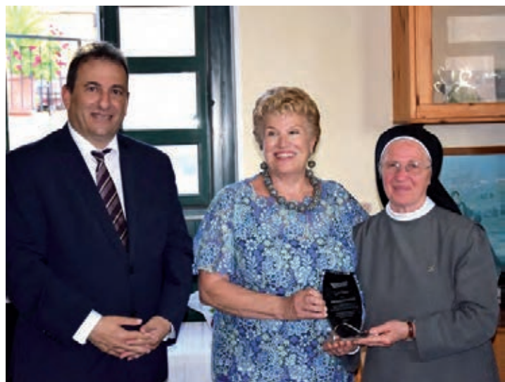
The community of Kormakiti

She then visited our chapel and the chapel of the Blessed Virgin Mother where she lit a candle and kissed all the icons as is the Orthodox custom.